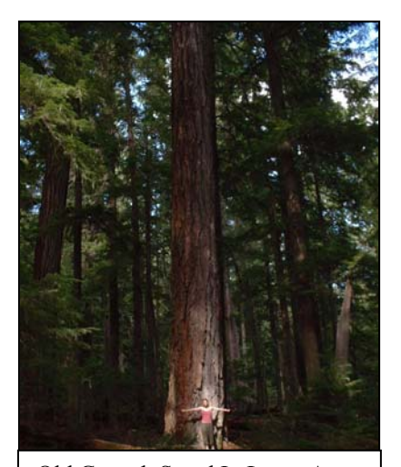
Old Growth Stand In Lease Area

Data compiled by Dan Peplow for the University of Washington's Center for Water and Watershed Studies regarding the impacts of mining in eastern Washington provides useful information about potential impacts of mining in the Goat Mountain area on fish, wildlife, and vegetation. Peplow found that mining pollution reduced species diversity and abundance in aquatic invertebrate communities. Rainbow and resident trout were found with concentrations of cadmium and zinc, and mammals in mine contaminated areas have been found with concentrations of arsenic, nickel, selenium, and zinc in their milk. Doug fir trees in the area, moreover, have been found with concentrations of manganese, zinc, iron, and aluminum in their needles. 82