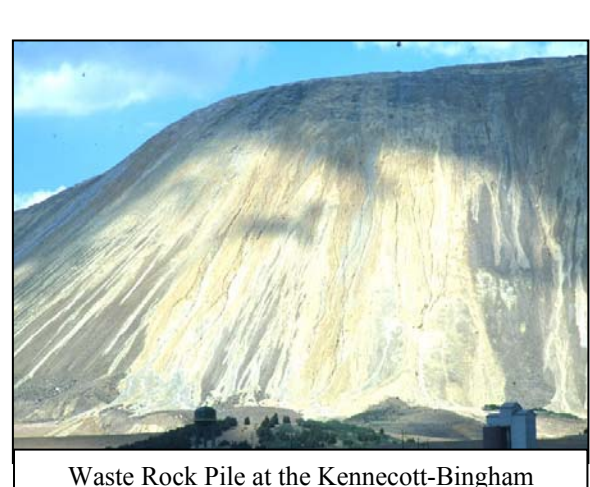
Waste Rock Pile at the Kennecott-Bingham Copper Mine in Utah

The numbers are just as shocking when considering specific metals. A single gold ring, for example, leaves in its wake at least 20 tons of mine waste.<sup>52</sup> And as a global average, one ton of copper results in 110 tons of waste ore and 200 tons of soil and surface rock.<sup>53</sup>