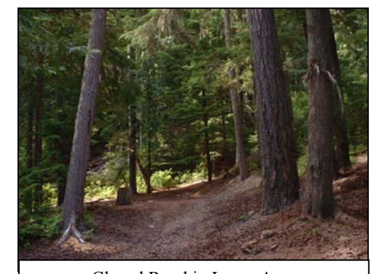
Closed Road in Lease Area

Mine development in the Goat Mountain area will require a significant amount of new infrastructure. It would require the reconstruction of at least 20 miles of road which would have impacts on area fish and wildlife. There is speculation that mine development may also require the construction of a new road or railroad line and power lines between the community of Randle and the mine or a road south of Goat Mountain through the Mount St. Helens National Volcanic Monument. Such infrastructure would have impacts on forest and aquatic habitat beyond the areas previously discussed in these comments. If diesel generators are used to provide power, then trucks