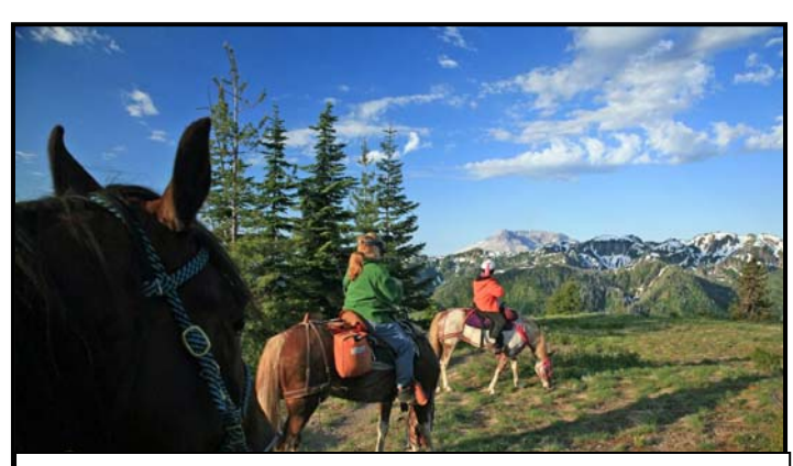
Backcountry horse riders on Goat Mountain looking south

The lease area also includes popular recreation destinations. The Green River Horse Camp lies within Mineral Survey 1329 and the Green River Trail (# 213) traverses through the same area. A number of other recreation destinations such as the Goat Mountain Trail, the Ryan Lake Picnic Area and Viewpoint, Deadmans and Deep Lakes, the Mt. Margaret Backcountry, the western portion of the Green River Trail, the Quartz Creek Big Trees Loop Trail, and the Tumwater Mountain Trail are all in close enough proximity to be impacted by mine development in the lease area or in the Margaret North and Red Bonanza unpatented lode claim