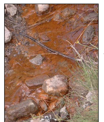
Evidence of possible ARD in the Green River Valley

The copper porphyry ore deposits in the lease area are strongly associated with acid mine drainage problems found across the U.S. and throughout the world. Not only this, but a 2002 report by the Washington Department of Ecology, titled, "Second Screening Investigation of Water and Sediment Quality of Creeks in Ten Washington Mining Districts, with Emphasis on Metals," found acid mine